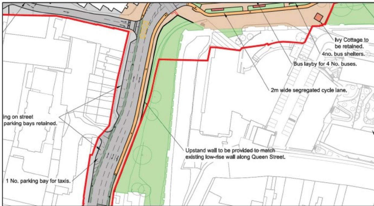
Option 1 – On Road Cycleway