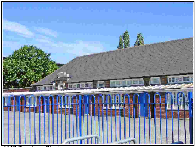
AMR Teaching Block