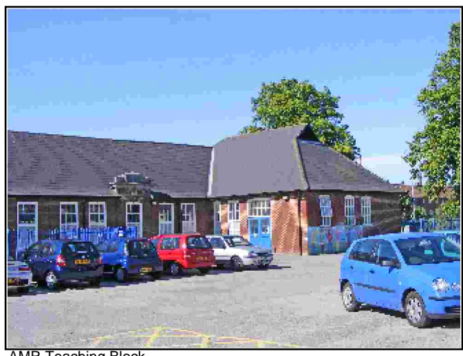
AMR Teaching Block