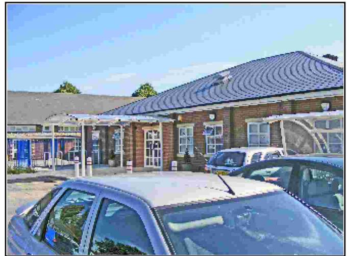
AMR School Entrance