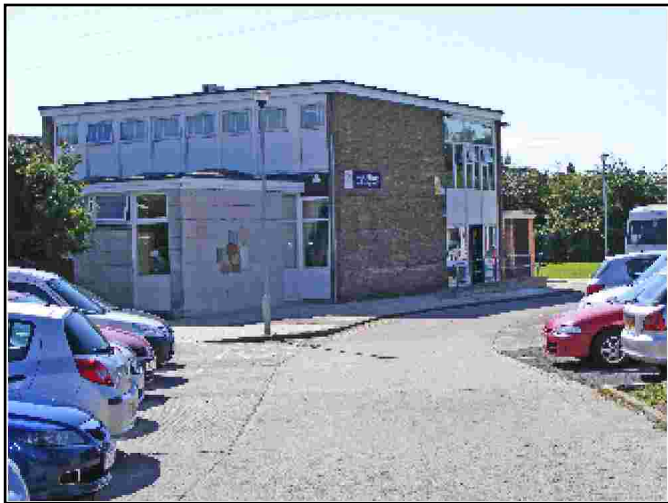
AMR Front Entrance