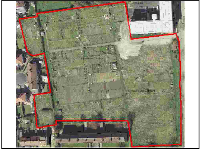
AMR Ariel View