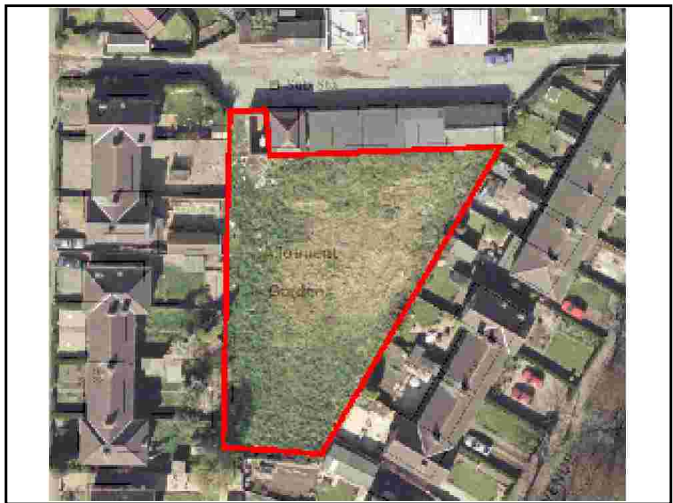
AMR Ariel View