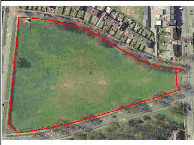
AMR Ariel View