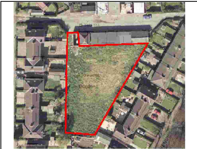
AMR Ariel View