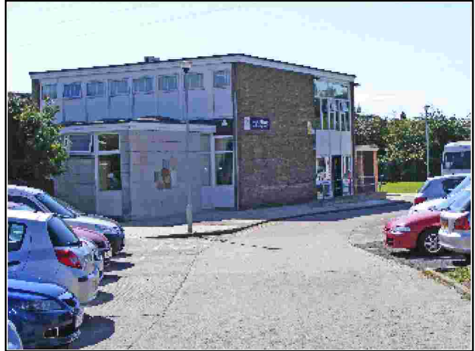
AMR Front Entrance