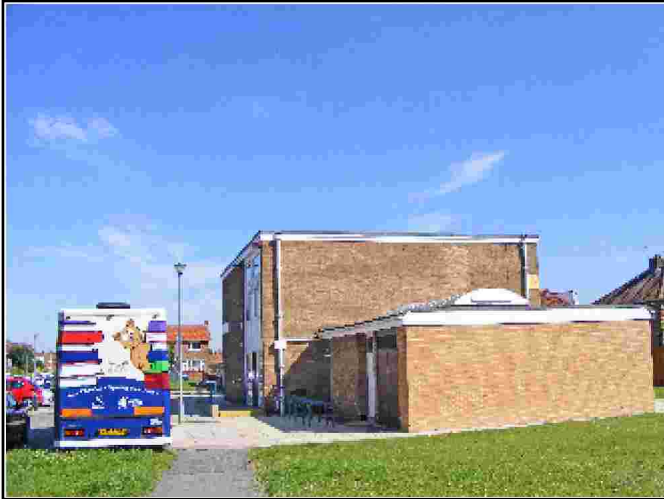
AMR Rear Elevation