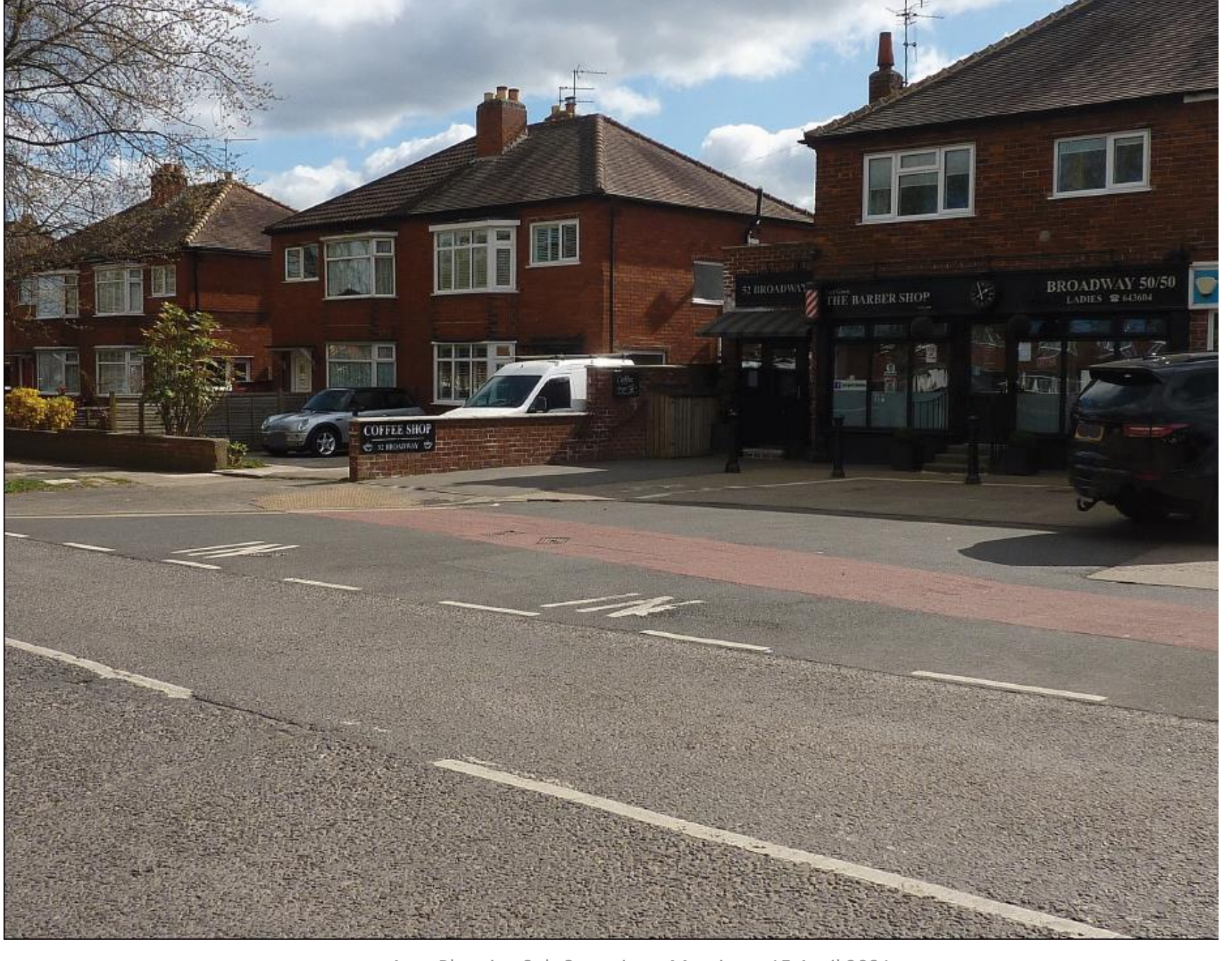
Area Planning Sub Committee Meeting - 15 April 2021