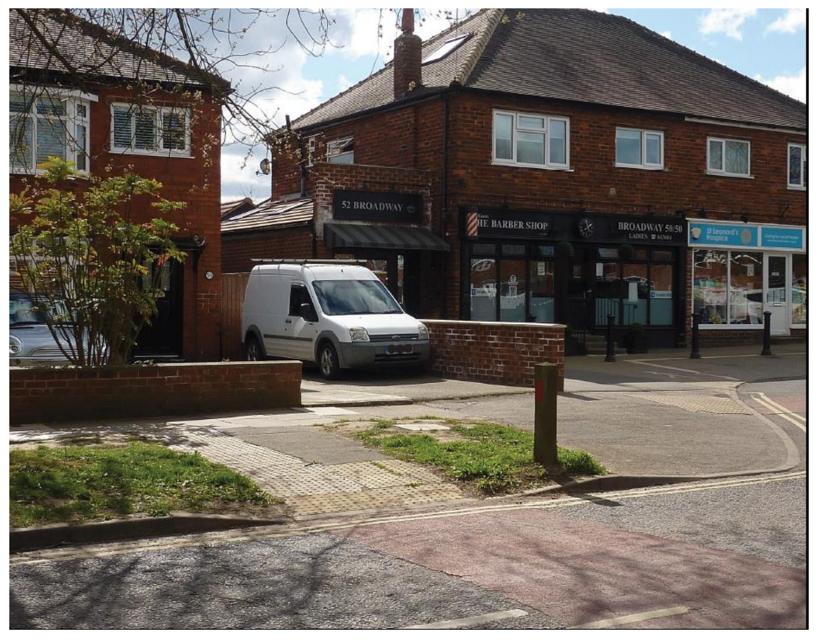
Area Planning Sub Committee Meeting - 15 April 2021