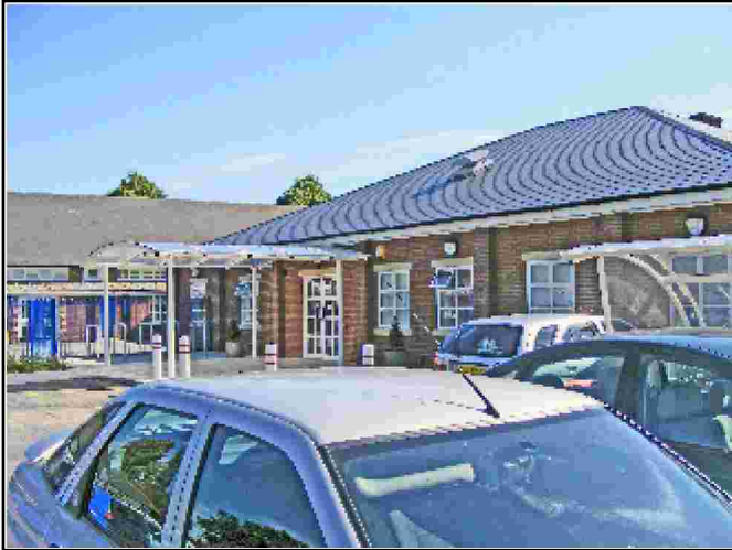
AMR School Entrance