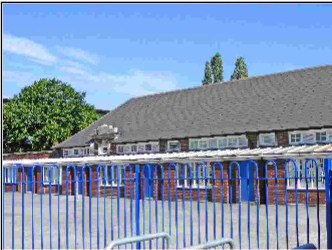
AMR Teaching Block