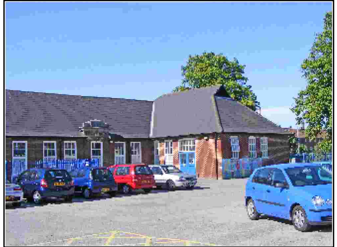
AMR Teaching Block