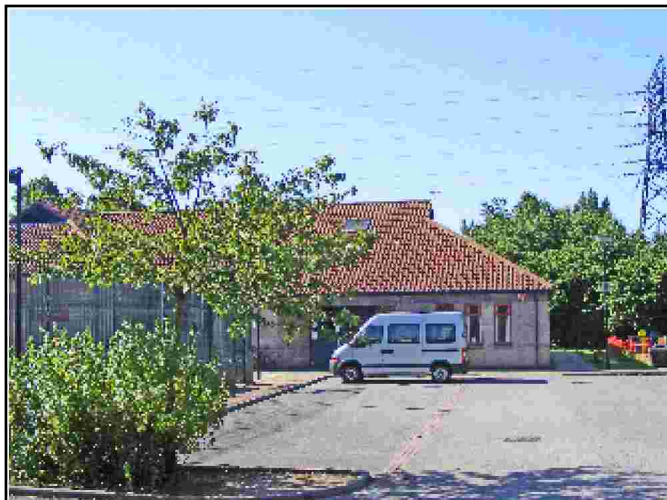
AMR Centre & Parking