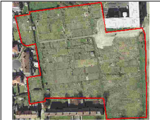
AMR Ariel View