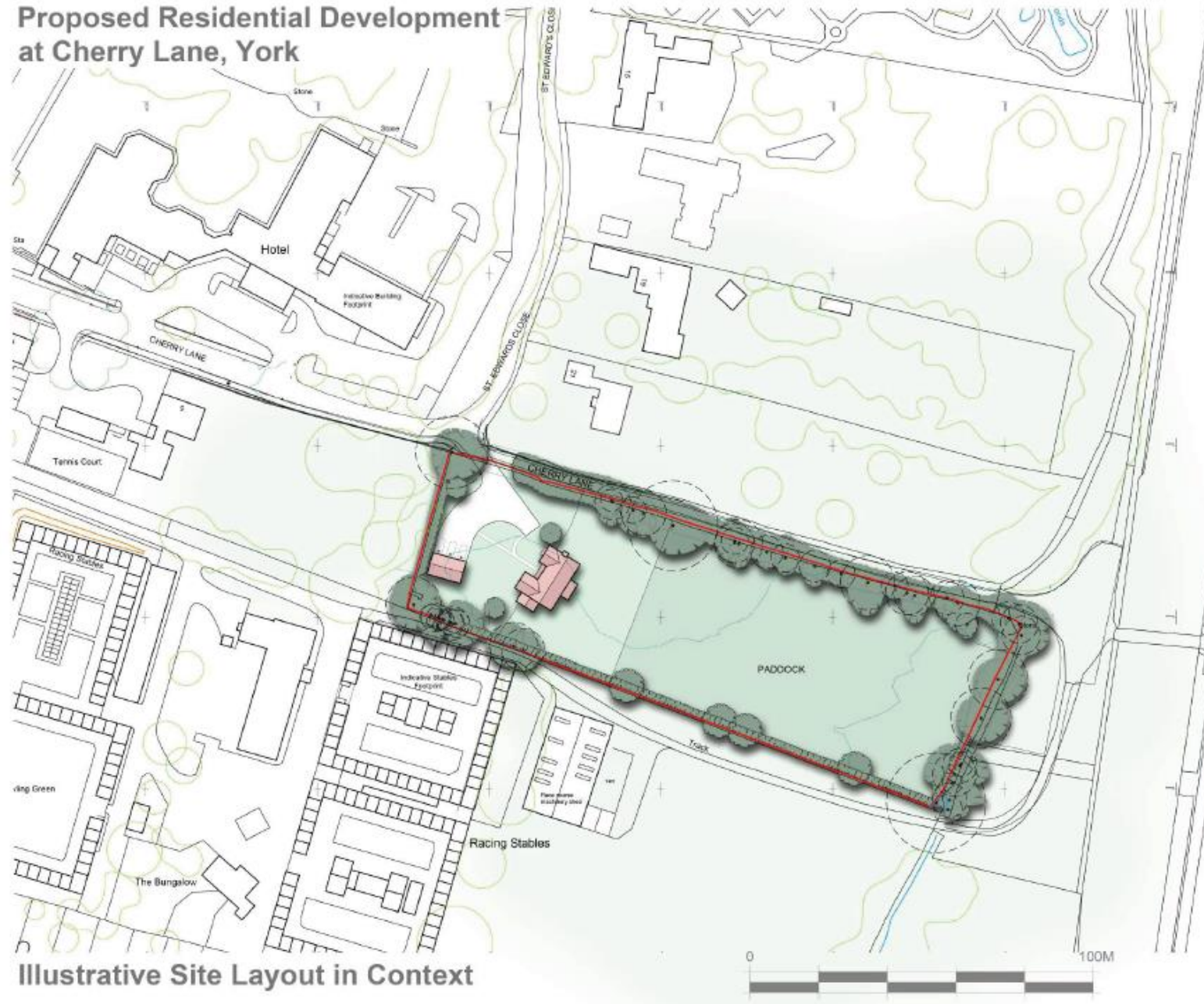
Illustrative Site Layout in Context