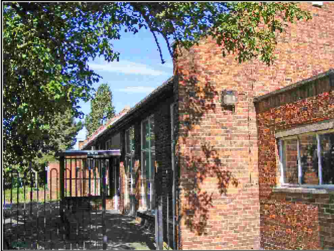
AMR Side Elevation