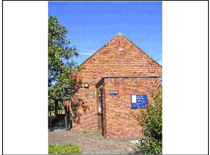
AMR End Elevation