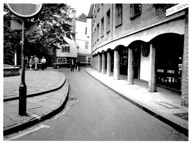
Kings Court circa 1960