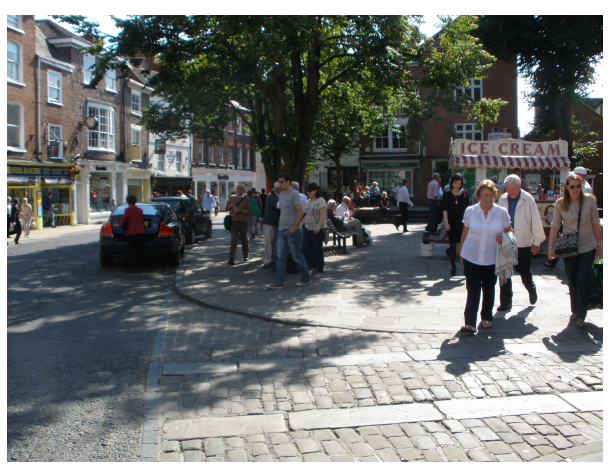
Kings Court 2012