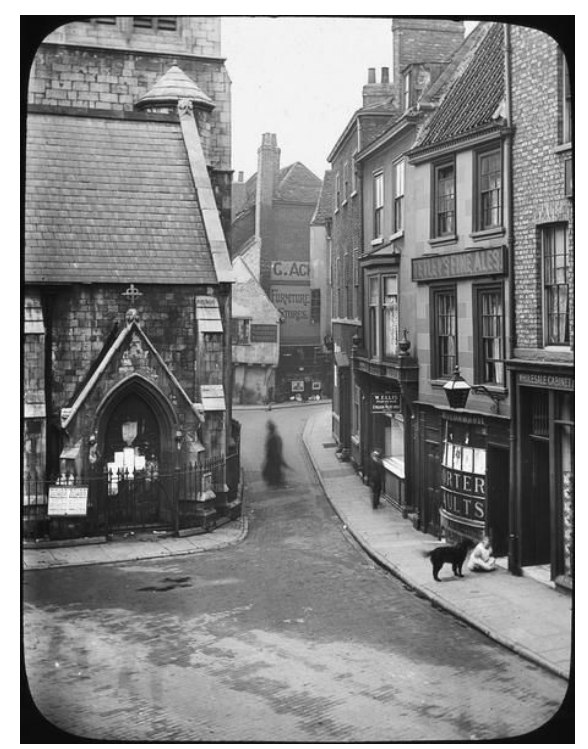
1908 Kings Square